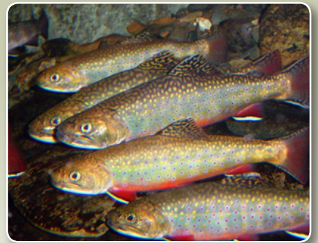
Eastern Brook Trout.

species such as Eastern Brook Trout. Both the research and tools from this project are being linked directly with ongoing and future stream flow, temperature, and biological response monitoring and modeling efforts within the DOI Northeast and Southeast Climate Science Center and neighboring LCCs. The prioritization tool and web viewer are available on the Appalachian LCC Web Portal ( http://applcc.org ).