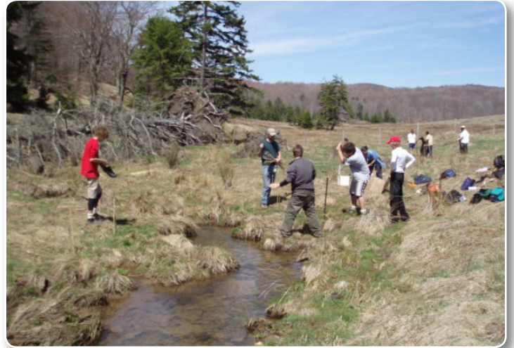
By locating the best spots to plant trees, managers can provide shade to maintain cold water stream habitat. Volunteers above plant trees to reforest the riparian zone at Big Run stream in West Virginia.

Due to rises in global temperatures projected during this century, riparian zones and the water bodies they surround are likely to face dramatic changes. These zones of forested areas along the banks of rivers, streams, and lakes host a tremendous amount of biodiversity and link many aquatic and terrestrial ecosystems, acting as a corridor for wildlife. But regional climate change models predict increased stream temperatures, alterations in precipitation, and shifts in the distribution of plants and animals that can disrupt the ecological services these systems provide. Such changes are likely to impact the abundance of vital coldwater species, such as the Eastern Brook Trout, and pose major challenges for conservation and natural resource management. Given the observed and projected changes, resource managers need tools that help them create more adaptive and resilient landscapes.